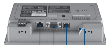
Ethernet COM1 (RS-232/422/485) USB Client Micro SD Slot